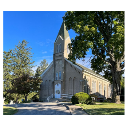
Weekend Worship Sunday 9 am

September 29, 2024 Twenty-Sixth Sunday of Ordinary Time