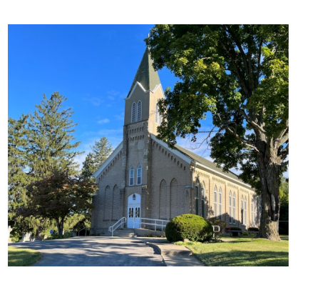
Weekend Worship Sunday 9 am

September 22, 2024 Twenty-Fifth Sunday of Ordinary Time